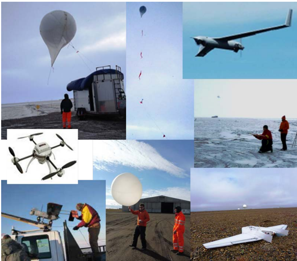
Figure 3: UAS Operations from Oliktok Point/AMF3. (Clockwise from upper left): Tethered Helikite launch (Sep. 2014), Helikite with tethered sondes (Sep. 2014), ScanEagle (Arctic Shield, July 2015), DataHawk launch (COALA, Oct. 2014), DataHawk-2 (ERASMUS, Aug. 2015), Balloon Sonde launch (ERASMUS, Aug. 2015), BAT-3 and Aeryon Scout (NMSU UAV Tests, 2012).