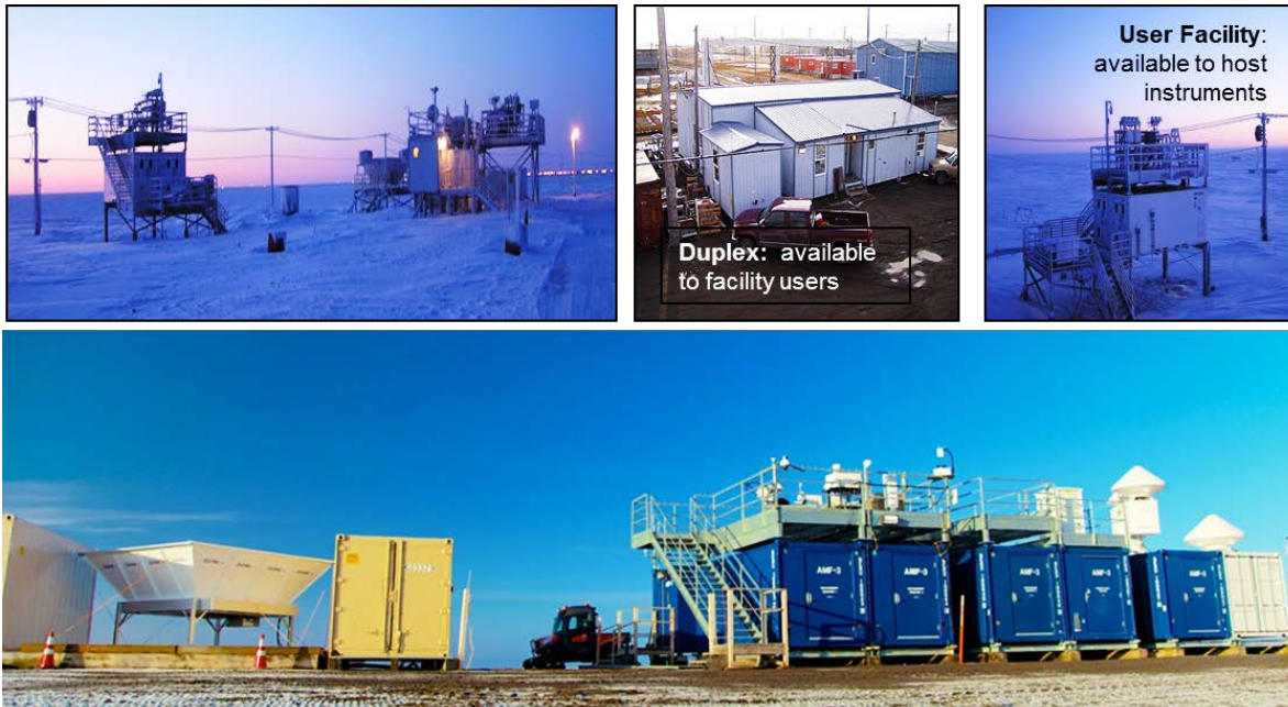
Figure 2: ARM North Slope Alaska Facilities. (Above) Barrow facilities are fixed, while (Below) Oliktok Point/AMF3 facilities are mobile.

Measurements at the Margins: Trends that point to accelerated warming in the Arctic include the shrinking spread and year-to-year loss of sea-ice and temperatures (rising at twice the rate of the rest of world), and increasing instability in the region’s permafrost layer, which stores vast amounts of methane in its frozen grip—for now. Computer models used to test scientific theories have yet to simulate these conditions with a high level of accuracy. Largely due to the difficulties in obtaining the needed observational data for the models, the ARM NSA facilities collect data to fill those gaps. Instruments that are operated at these sites are listed in Table 1.